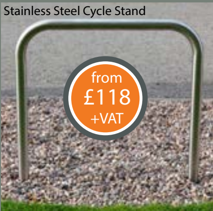
Stainless Steel Cycle Stand