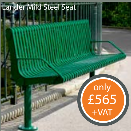
Lander Mild Steel Seat