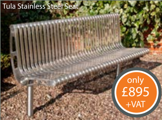
Tula Stainless Steel Seat